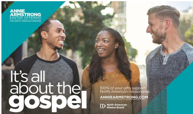
Annie Armstrong Easter Offering Week of prayer March 1-8

March 8 th (after evening service) Monthly Business Meeting